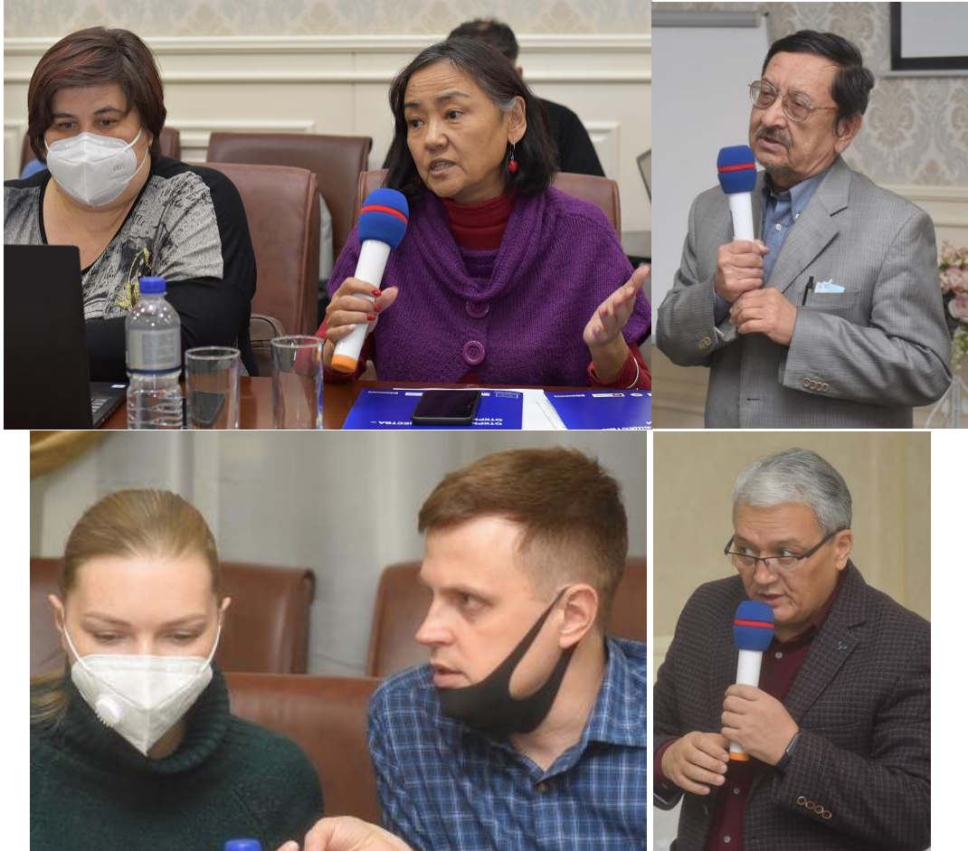
Discussion panel of the Dialogue platform

- the second part was organized in the form of discussion panel, obtained information was deliberated, and the comments of participants were given. The conclusions according to performances and presentations were made by the moderator of dialogue platform, in the process of what the different recommendations concerning the enhancement of ecological situation in our country were suggested. Without any doubt, these recommendations will be included to the plan of actions for near future as a perspective.